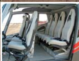
FRONT FACING, THEATER-STYLE SEVEN PASSENGER SEATING